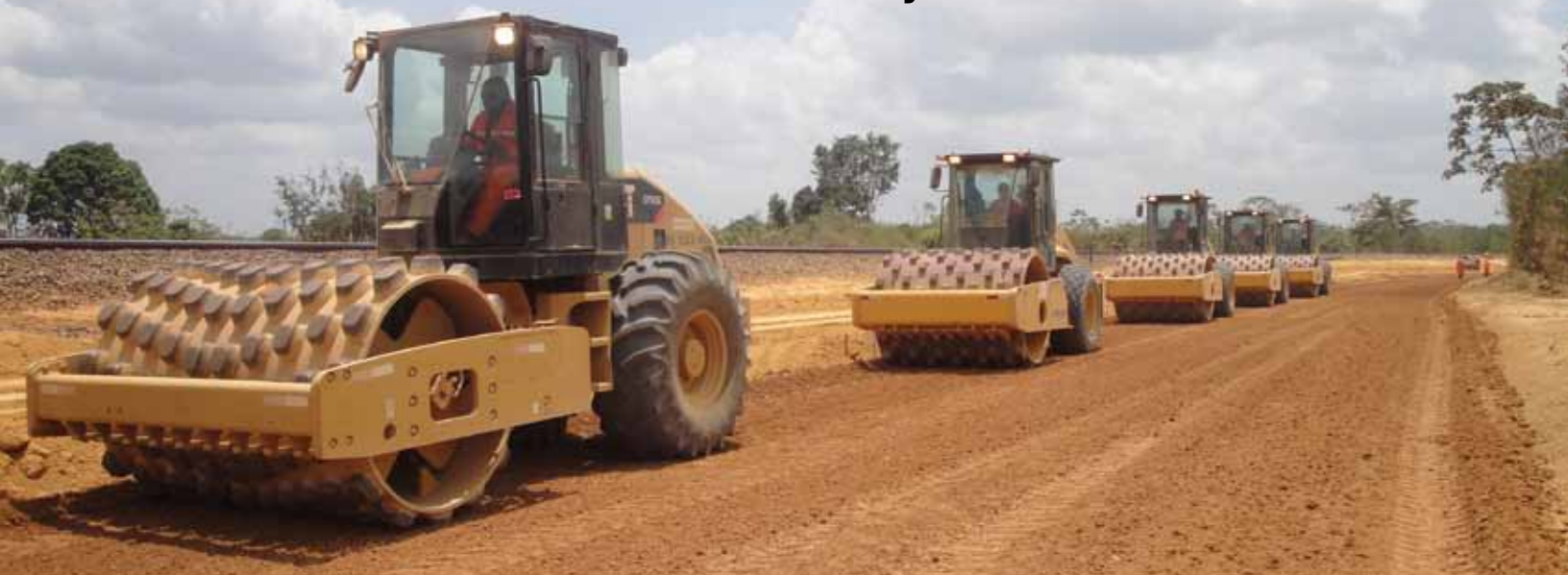
Compaction of EMC SQUARED System Stabilizer Application