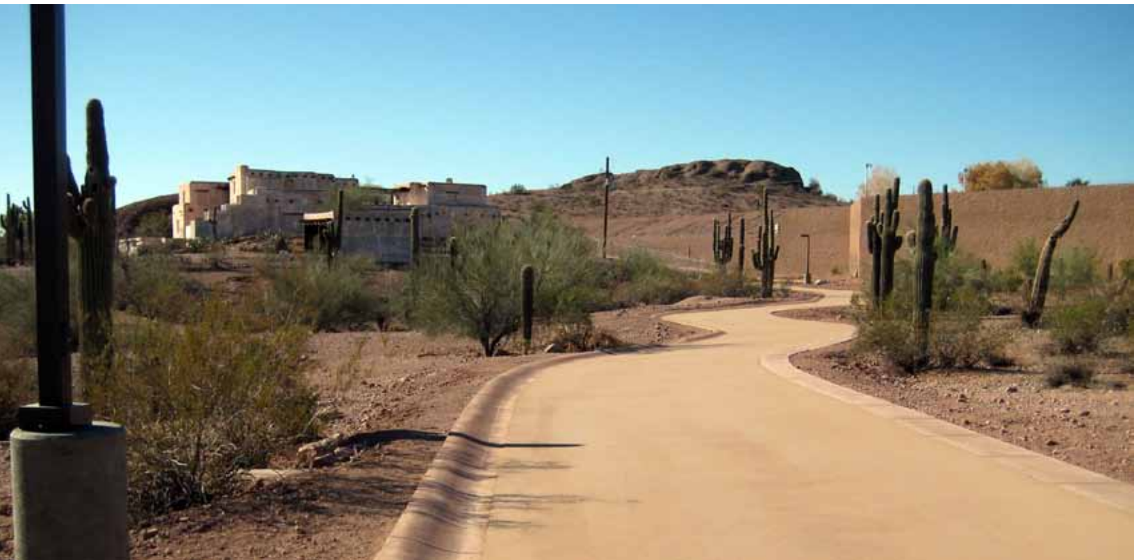
NaturalPAVE XL Resin Pavement Access Road to City Water Treatment Facility

The availability of cool pavement materials is important to human health as global warming increases the daytime temperature of black asphalt pavement surfaces to ever higher temperatures. With asphalt pavements reaching summertime temperatures nearing 180°F in hot climate areas such as Las Vegas and Phoenix, these heat absorbent pavement materials are no longer appropriate for places where people spend time outdoors or recreate, such as school playgrounds and pedestrian pathways. While the medical community has not yet established temperature red lines above which human health is placed at risk, pavement surfaces that reach temperatures 40°F to 60°F degrees hotter than afternoon air temperatures are clearly hazardous to human health as they radiate an excessive amount of heat back up from the pavement surfaces. Cool pavement protects our health and promotes quality of life.