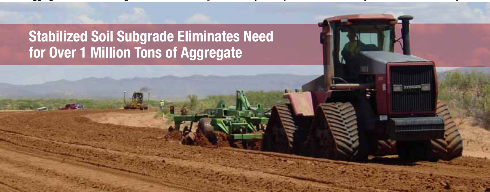
Subgrade Stabilization with Disc Mixing of EMC SQUARED Stabilizer Treatment