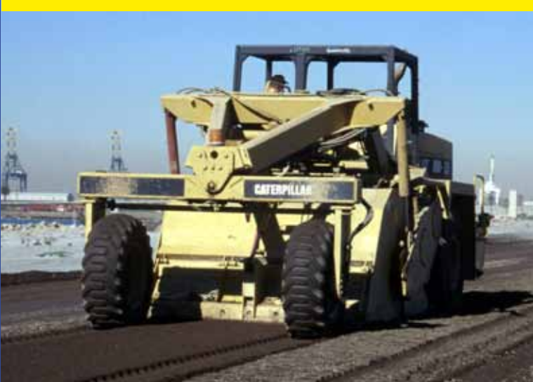
Port of Los Angeles - Pier 400 Project Los Angeles, California

Aggregate materials incorporating asphalt millings and crushed concrete