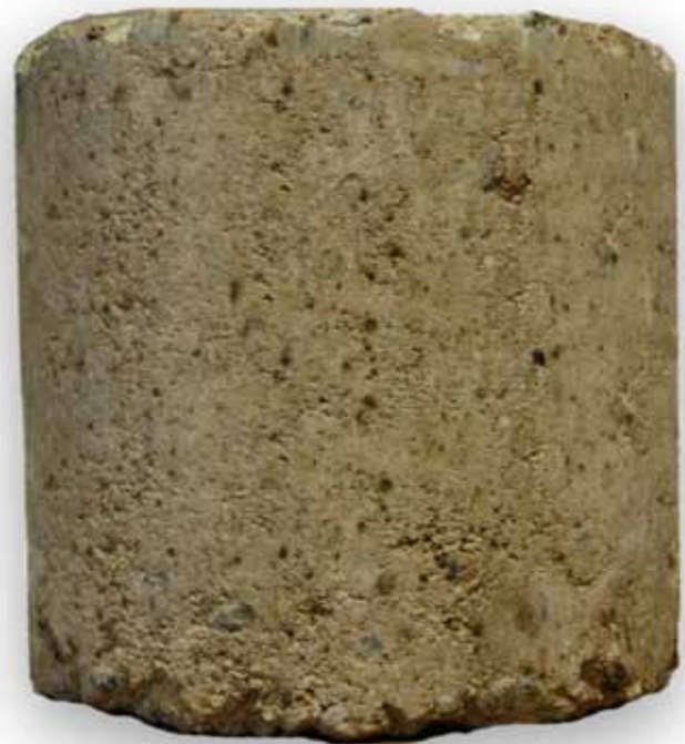
Recycled Aggregate Treated With EMC SQUARED Stabilizer (1000) (Test results at right)

Aggregate materials are mined from riverbed deposits and hard rock quarries. They are a non-renewable resource that is vanishing from near proximity to most urban areas. One-way haul distances to new sources of virgin aggregate materials are now often in the range of sixty to one hundred miles from the project site. Fortunately, recycling technology has improved to the point where a large portion of the old asphalt and concrete pavement is being milled and crushed for reuse during highway reconstruction projects. While these recycled aggregates are often substandard to virgin aggregate materials, they typically have the potential for outstanding performance when upgraded with EMC SQUARED® System treatments, providing strong but flexible layers similar in load carrying capacity to hot mix asphalt.