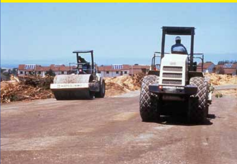
Total Environmental Restoration Contract (TERC) Fort Ord, Monterey, California

The EMC SQUARED System was chosen for treatment of recycled pavement aggregate materials used in construction of this unpaved parking lot designed for temporary service during the building of a multi-story parking garage. The stabilized aggregate was protected by a dust control armor coat which was spray applied to the surface. The university then added parking lot striping. After over five years of service the stabilized aggregate layer exhibited little gravel loss and remained in excellent condition.