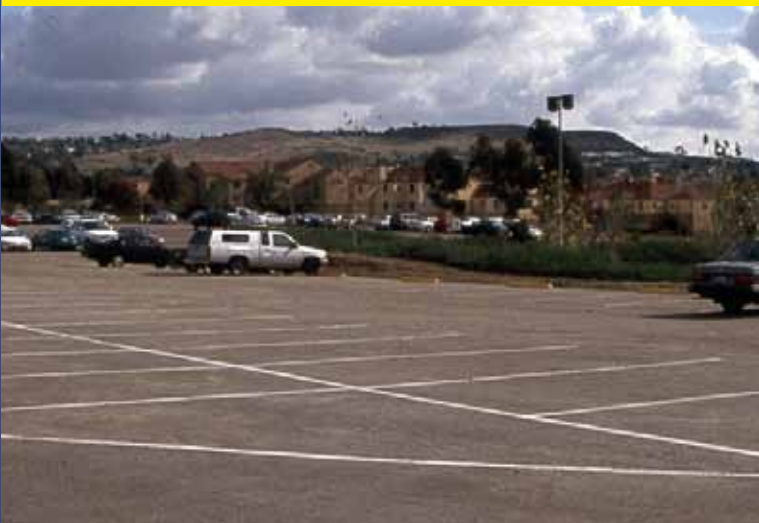
University of California at Irvine (UCI) Irvine, California

The EMC SQUARED System was selected for stabilization of the construction haul roads for this major facility expansion project. The stabilized recycled pavement aggregate materials (known locally as Crushed Miscellaneous Base, or CMB) provided running surfaces for construction access roads and a stabilized base course for the paved road servicing this 484 acre, $794 million dollar terminal construction project.