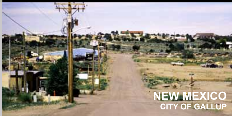
NEW MEXICO CITY OF GALLUP