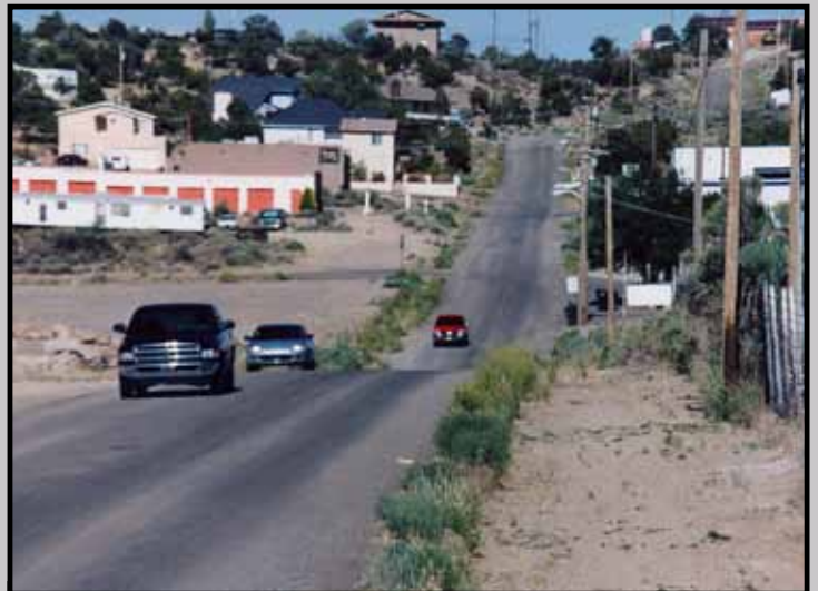
Asphalt Millings (RAP) Stabilized with EMC SQUARED® Stabilizer (utilized for five years as a street surface)

The aggregate material from the street surfacing project was sampled and shipped to the Texas Transportation Institute