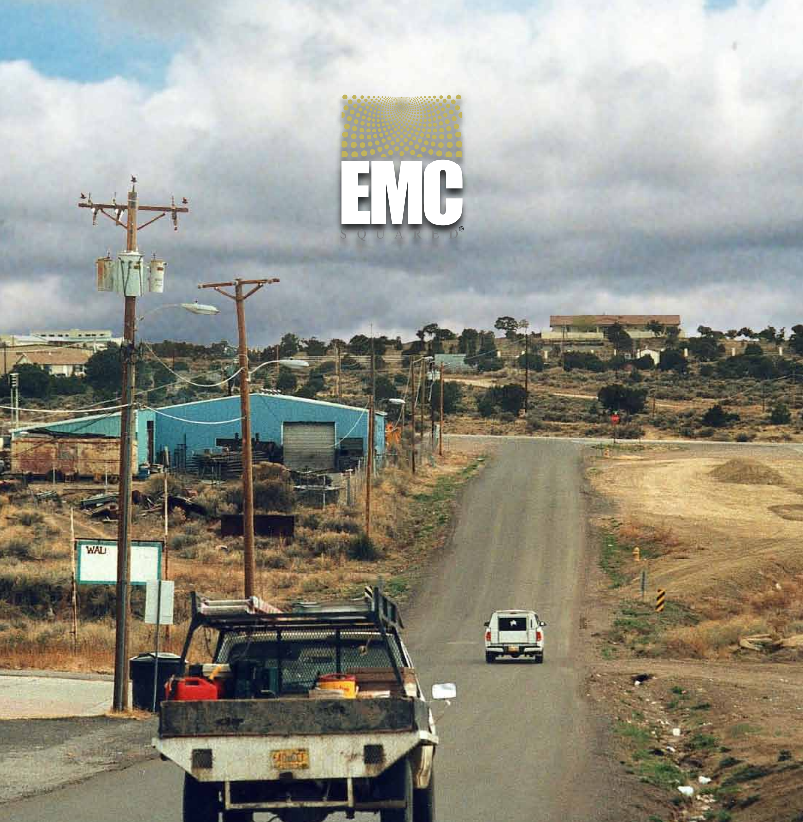
Aggregate Surface Course Stabilization Project