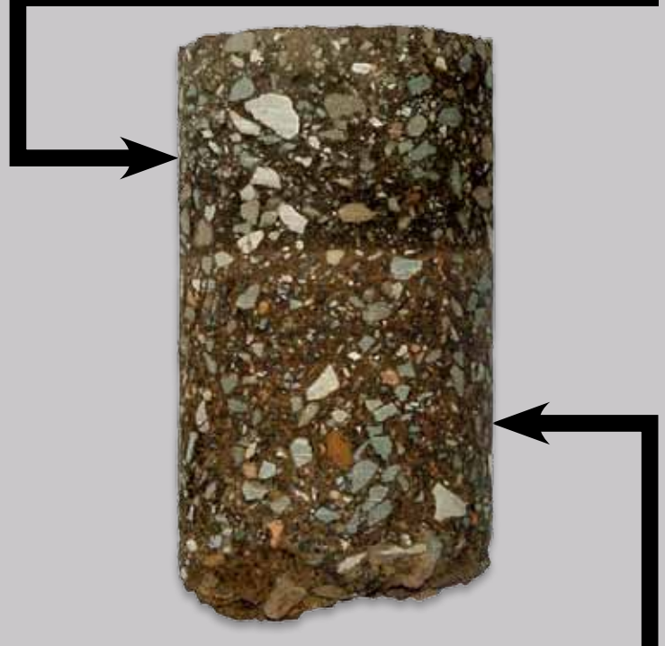
Aggregate Stabilized with EMC SQUARED® Stabilizer (utilized for two years as a street surface)