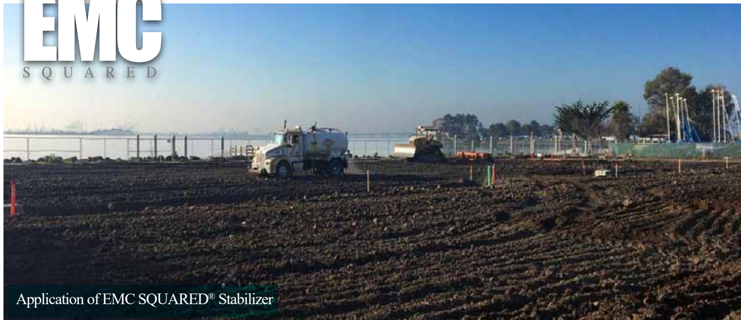
Application of EMC SQUARED® Stabilizer

With historical soil contamination problems to deal with, an unpaved parking lot adjacent to San Francisco Bay that is frequented by windsurfers presented the City of Berkeley's Parks, Recreation & Waterfront Department with a challenge. When it came time to upgrade the parking area from a potholed gravel surface to a paved parking lot with a bathroom facility and artificial turf areas for windsurfers to set up their equipment, the biggest challenge for the Department's design engineers was the limited budget they had available. With plans to place a hot mix asphalt pavement surface course, regulatory agencies would allow the City to encapsulate the contaminated soils in