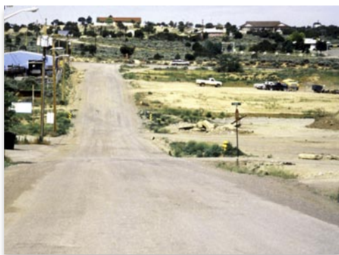
Aggregate Stabilized with EMC SQUARED® Stabilizer (utilized for two years as a street surface)

After reviewing technical information on the EMC SQUARED® System and contacting