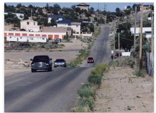
Asphalt Millings (RAP) Stabilized with EMC SQUARED Stabilizer (utilized for five years as a street surface)

other public agency personnel with previous field experience, the City's first project was full depth in-place recycling of the distressed asphalt access road to their corporate yard facility. The existing asphalt pavement and aggregate base materials were pulverized and mixed with the stabilizer solution by an asphalt reclaimer mixing machine. After proving out the 9-inch thick stabilized layer under their daily truck traffic, they surfaced the stabilized base with new asphalt pavement. A decade later this pavement is smooth running and free of distress.